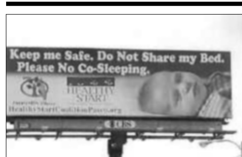
Florida SIDS Alliance partners with the "Healthy Start of Pasco County is here to support you!" Safe Baby billboards - June 2011.